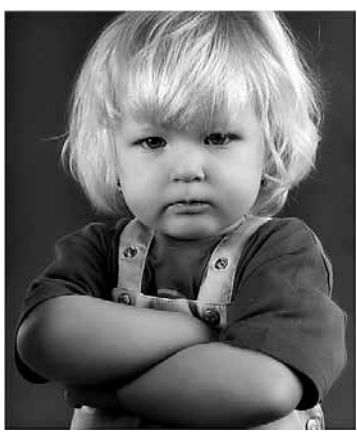
you thought I wasn't looking.'

When you thought I wasn't looking I looked at you and wanted to say,' Thanks for all the things I saw when